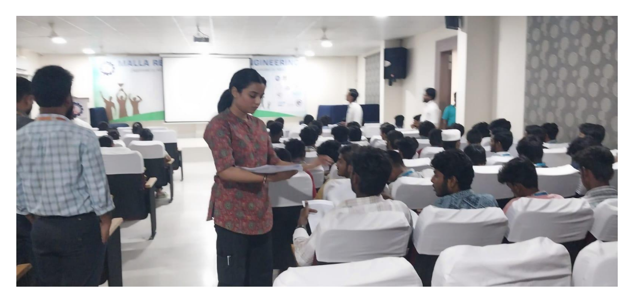
Through the workshop, the students have gained an awareness about mental health and its relevance.